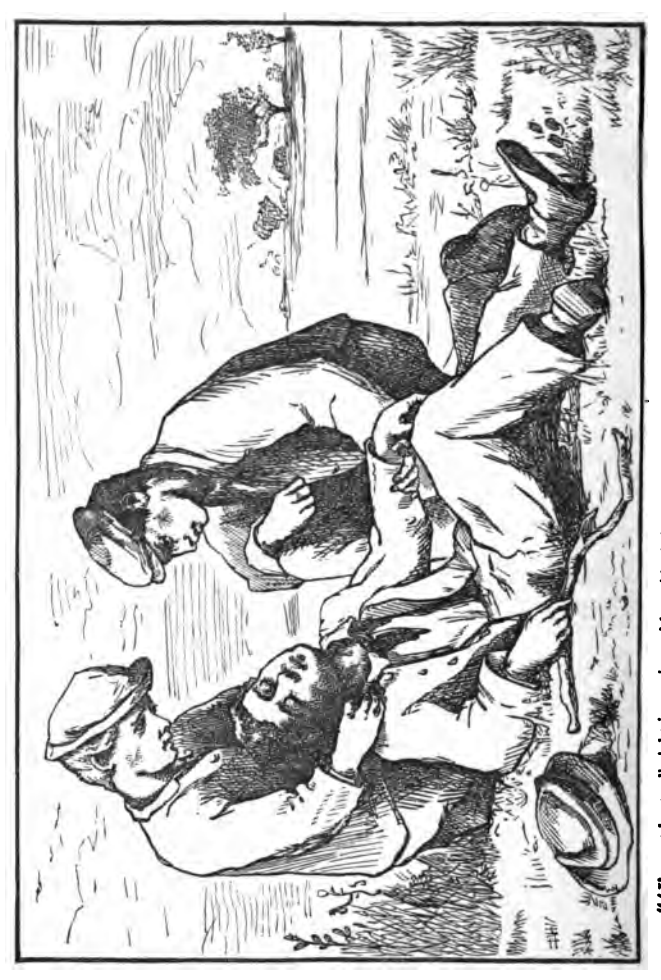
MEN; or, LIFE AT PLUMFIELD WITH Jo's LITTLE Boys. Price, $1.50.